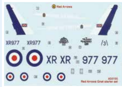
Photo 2 The small decal sheet carries markings for Red Arrow XR977 based at Royal Air Force Kemble Gloucestershire England during 1978/79.