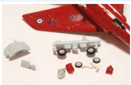
Photo 7 The undercarriage wheels and nose leg along with some small aeriels can be assembled to finish the model. Provision is made for the undercarriage to be omitted and the model posed in the flying configuration, these are the small unpainted parts on the left of the picture.