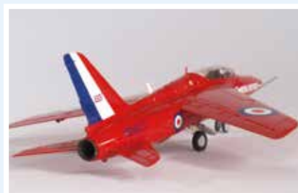
Photo 8 This is a lovely little model and a pleasure to build. Now all that is needed is another eight to form the rest of the team.