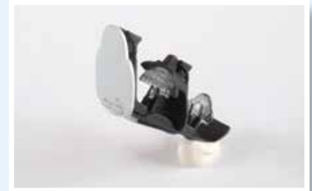
Photo 3 The first six stages of construction build up the cockpit detail, consisting of floor, bulkheads, seats, control columns and instrument panels for which decals are provided for the instruments.