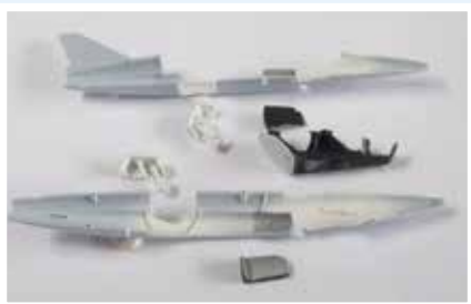
Photo 4 With the cockpit section complete, the undercarriage legs and bays are assembled along with the intake inner walls, before cementing the fuselage halves together.