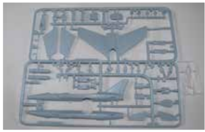
Photo 1 Spread over two sprues, are forty seven grey parts while two clear parts are carried on a separate sprue. Some of the parts are not used for this model.